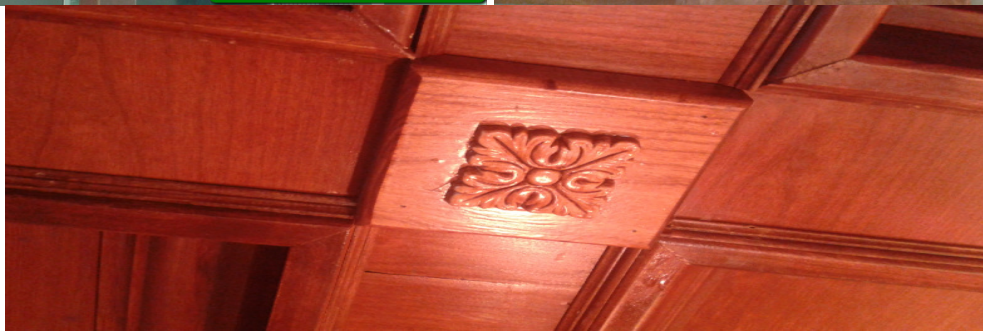
The Front of the Bar trimmed out in Cherry glass bead