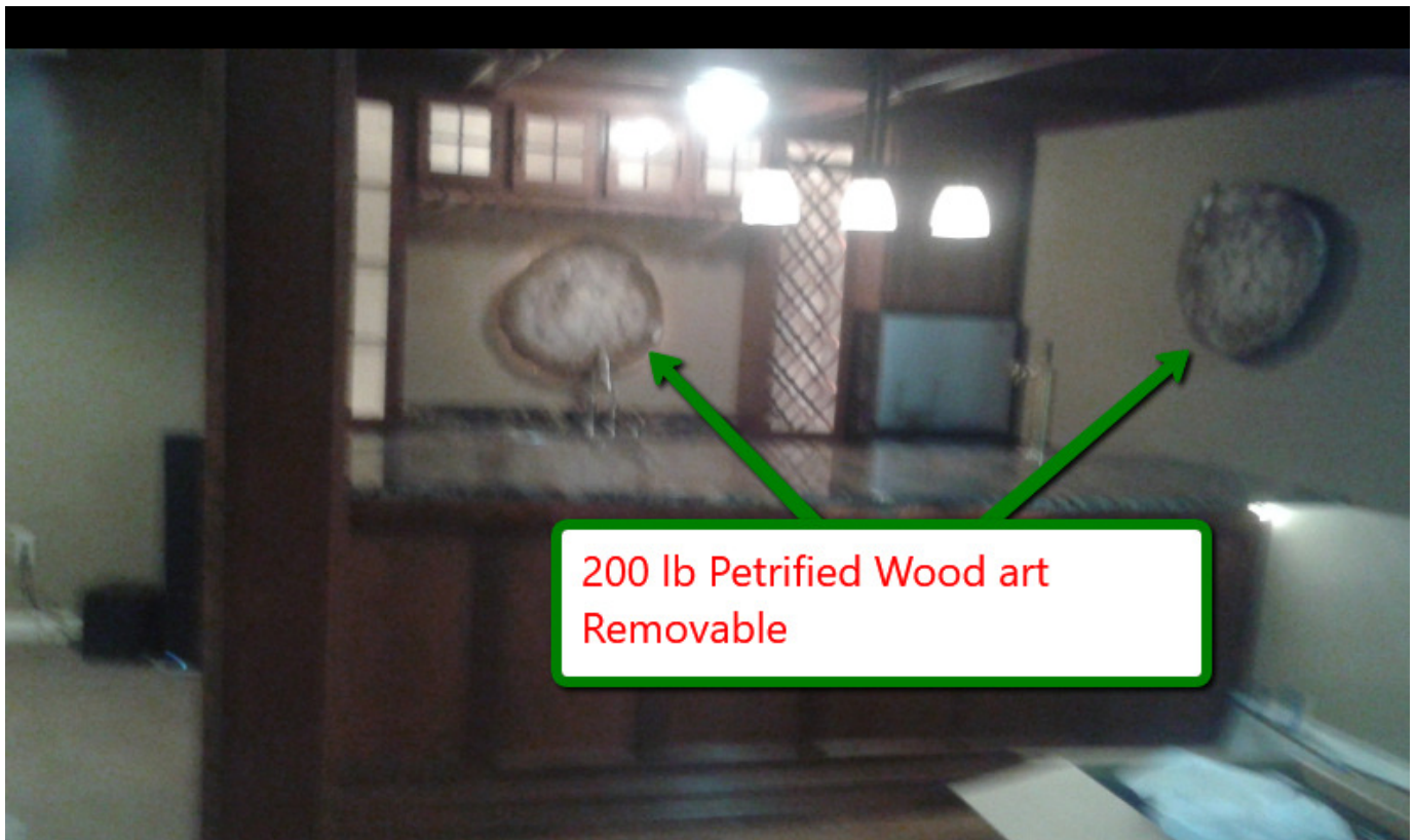
200 lb Petrified Wood art Removable