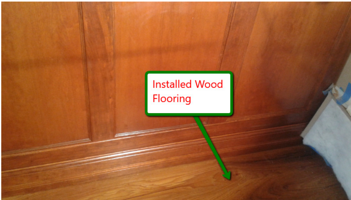
Rebuilt 2 drawer two door Cabinet for the Micro Wave