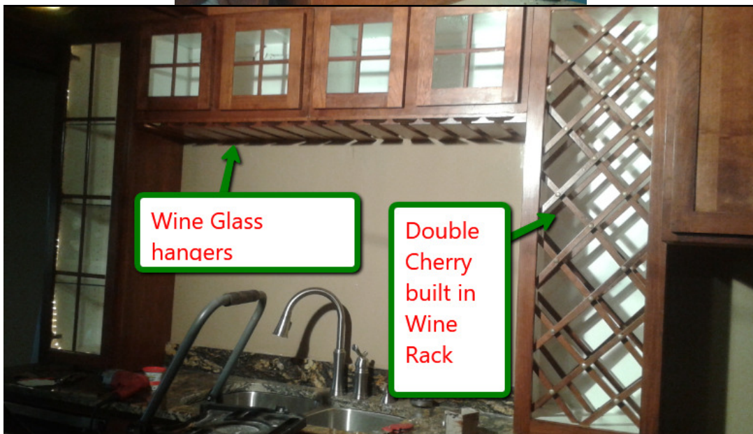
God showed me this wine rack solution after I failed by trying to notch the crosses, which destroyed themselves from the stress.